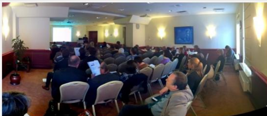
People interested in Plan Bothnia and MSP

Tags: conference, event, MaritimeSpatialPlanning, riga